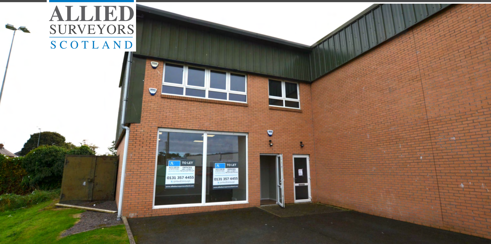
Unit 1 - Front Office

Tel. 0131 357 4455 X @AlliedEdinburgh www.alliedsurveyorsscotland.com